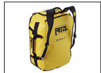
Padded, adjustable back and shoulder straps for comfortable carrying.