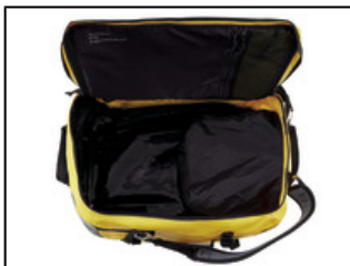
Large D-shaped opening for easy equipment organization.

Designed to be carried in multiple ways, DUFFEL 65 is a convenient, ergonomic bag with a volume of 65 liters. The back and shoulder straps are padded for comfort when used as a backpack. Versatile, it can be carried in multiple ways with removable shoulder straps. The large opening allows easy access to equipment, including two pockets in the inner flap and a large side pocket for a helmet or shoes. A large transparent area allows rapid identification of the bag. It is constructed of high-strength TPU tarp material for intensive use.